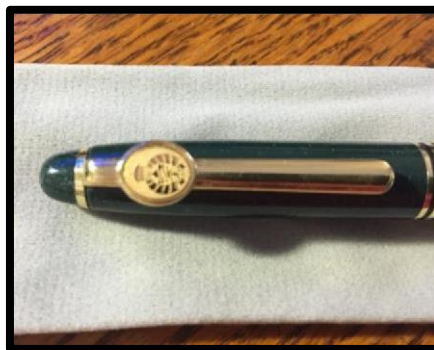
Pen - $25.00