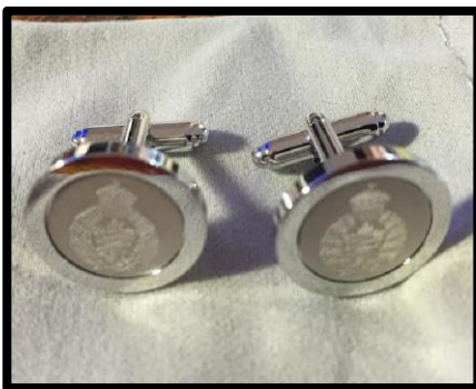
Cuff Links - $35.00