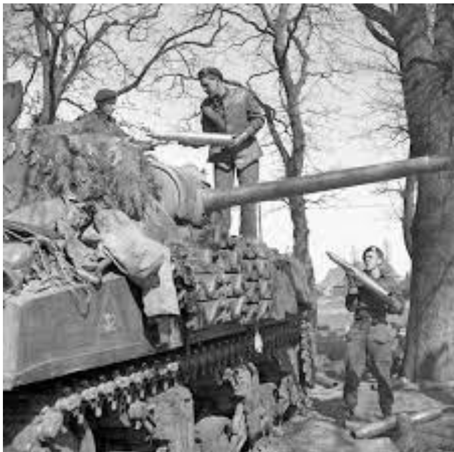
28 th Armoured Regiment (British Columbia Regiment)